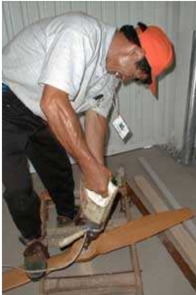
One of the Japanese making delicate propellor repairs before the first task.

The Director wanted to do a Navigation task but the weather wasn't up to it. We did a Precision task instead, which turned out to be the only task of the day. The task went well but pilots MUST respect the rules... A lot of points were lost in penalties.