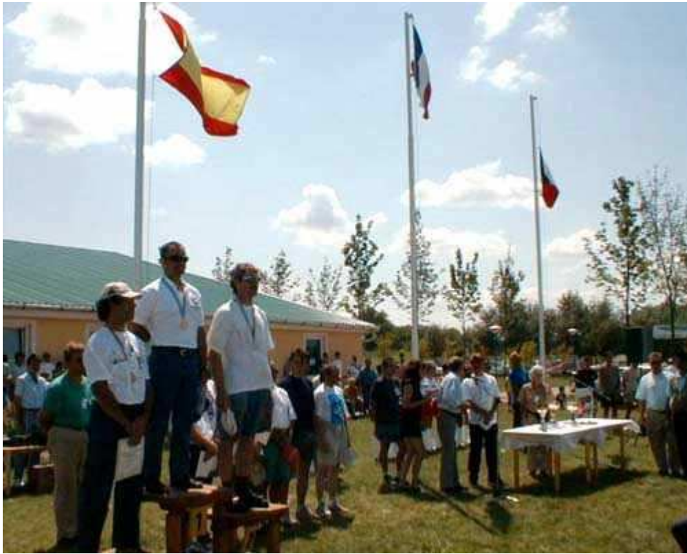
Site designed by rmh