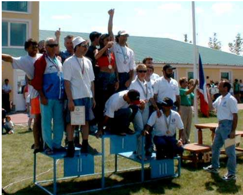
Site designed by rmh